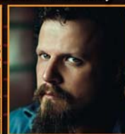
JAMEY JOHNSON BREAKTHROUGH ARTIST