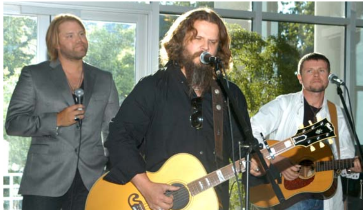
(L-R): Song of the Year co-writers James Otto, Jamey Johnson and Lee Thomas Miller performed "In Color."