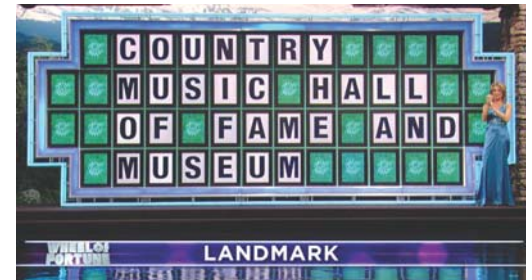
Wheel of Fortune star Vanna White reveals the "landmark" answer to one of the show's Feb. 18 puzzles: The Country Music Hall of Fame® and Museum.

Reigning ACM and CMA Male Vocalist of the Year Brad Paisley recently took his Paisley Party Tour to Canada, continuing his string of sell-outs. Over 225,000 tickets on 24 dates have been sold thus far in the first quarter for the outing with special guest Dierks Bentley and Darius Rucker in January, and Crystal Shawanda in February. The tour has sold-out thirteen of the first fourteen tour dates on the final leg, and stops March 14 at Nashville's Sommet Center.